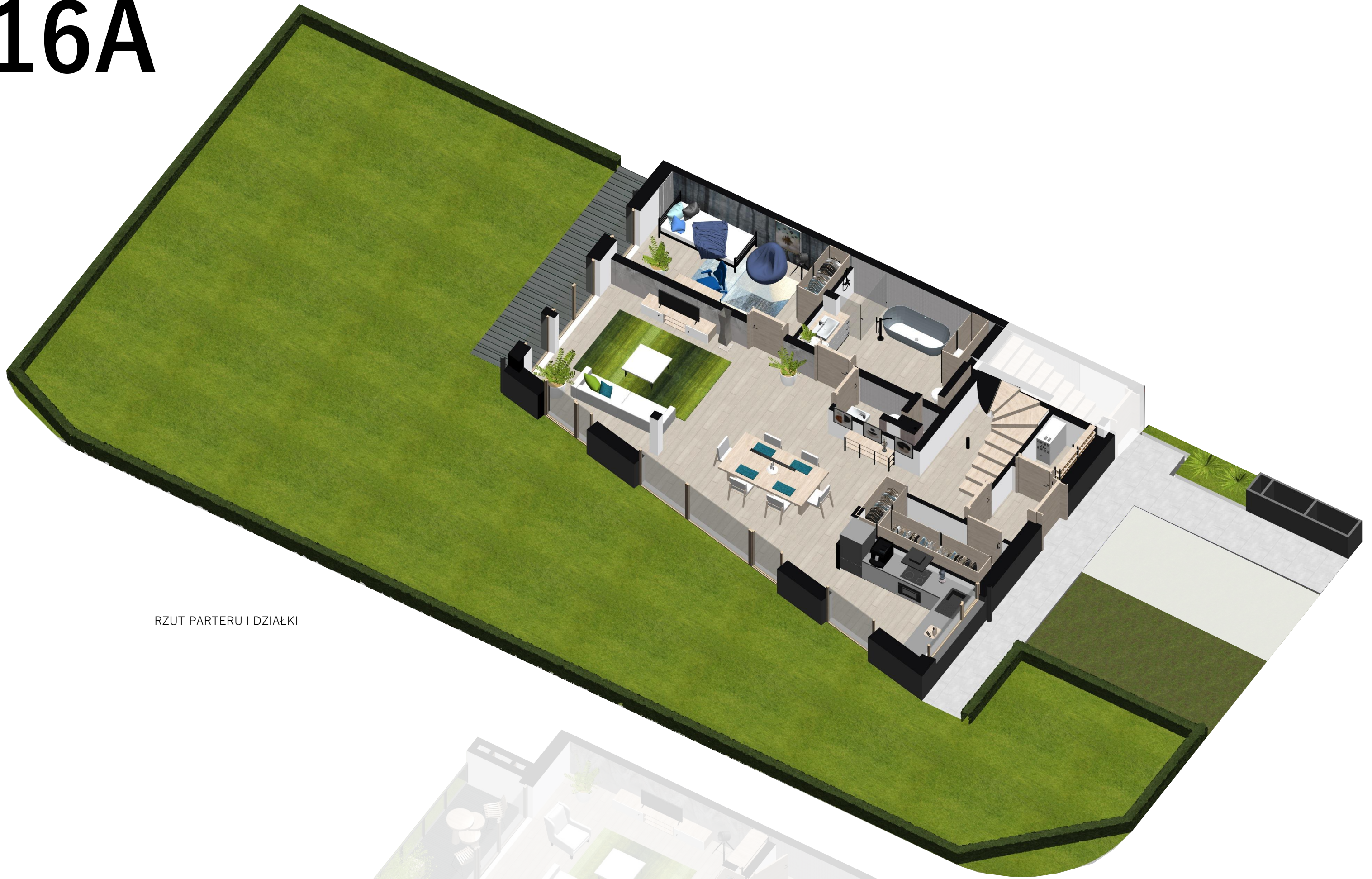
RZUT PARTERU I DZIAŁKI