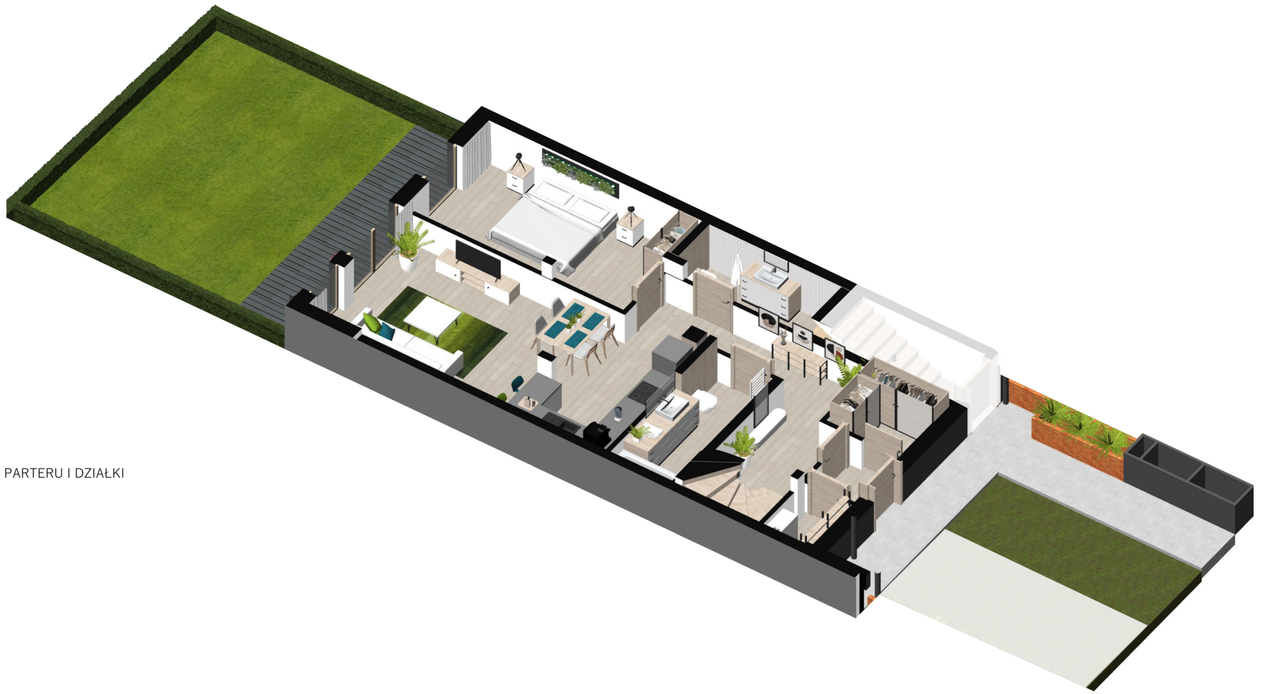
RZUT PARTERU I DZIAŁKI